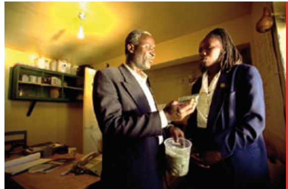
Health worker distributing ARV drugs to a support group for people living with HIV in Africa.

Addressing the myriad challenges of drug and diagnostic procurement requires a multifocal response. WHO trained regional consultants to support countries in preparing, revising and implementing Procurement and Supply Management (PSM) plans; developed workplans to strengthen their national PSM systems and address the main PSM problems confronted by each country. Partners in this effort included the Global Fund, several UN agencies and different departments and offices of WHO.