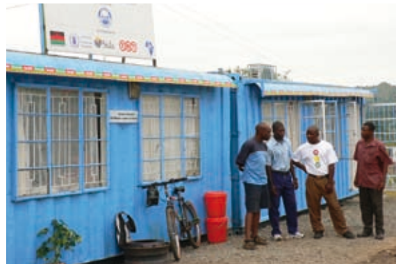
The Muyende Bwino wellness centre in Malawi.

The wellness centres are truly multipartner, multisector collaborations. GDC Whelson, the largest transport company in Malawi, donated the shipping containers that house the facilities; the Government of Malawi provided the location and supplies the basic drugs free of charge. The centres are operated by local nongovernmental organization Banja La Mtsogolo (BLM) which, along with UNFPA, provide condoms; the international nongovernmental organization PSI provides educational materials; and the Malawi Business Coalition Against HIV/AIDS and the Malawi Road Transport Operators Association promote the services among their members.