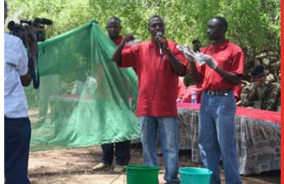
Serena Hotels' wellness educators explain to the local communities at Samburu Serena Safari Lodge how to treat a mosquito bed net, Kenya.

IFC provided training in programme monitoring and evaluation; provided seed funding to support the implementation, monitoring and evaluation of Serena's HIV activities; and through a collaborative