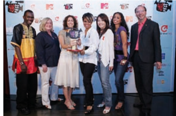
Judges and award winner of the MTV 48Fest film competition themed around AIDS.

What accounts for the disconnect, and how can it be overcome? Part of the problem may be found in the messages and approach of some HIV education efforts. Studies consistently show that prevention programmes that lecture or attempt to frighten young people are ineffective. Staying Alive takes another approach, one that focuses on informing and involving young people.