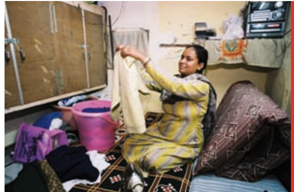
A woman producing clothes in India.

This pilot training effort produced a number of success stories. For example, almost all trainees in the computer course were hired into jobs in the field, as were all jewellery setting trainees. The tailoring students mounted an exhibition of their work, and have gone on to factory or boutique work. The spice packing trainees have also all started their own businesses, or were hired by companies.