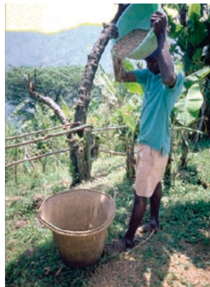
A villager around tea and sugar plantations in northern Uganda.

What the ILO is doing— The ILO provides advisory services on policy development and workplace mobilization, arranges training to develop the competencies and structures that sustain HIV awareness in the workplace, and supports the development of education materials addressing the HIV-related information needs and concerns of workers. These workplace interventions reduce stigma through policies, agreements and education to promote the principle of non-discrimination and encourage a supportive work environment and open discussion of HIV issues. The ILO works with private enterprises to ensure the availability of free services such as voluntary counselling and testing, care to prevent the transmission of HIV from mother-to-child, and condom availability for workers and for members of the surrounding communities. As a result, workers in locations such as the Uganda tea and sugar plantations are increasingly accessing counselling and testing services and medical support and care, including antiretroviral therapy.