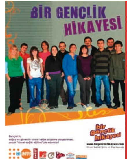
The campaign's poster.

Campaign trainings help young people become effective advocates for their own education and for the information needs of their peers. Advocacy workshops reflecting key campaign messages bring together young participants from 30 provinces in Turkey. Trainees then act as advocates for other young people, reaching out to peers and creating networks of awareness on SRH. Furthermore, trainees act as advocates for young people's information needs and SRH rights with local policy and decision-makers. So far, 70 young people have been trained as key advocates. In the first six months, the campaign joined youth events at 30 university spring festivals, three international music festivals and two national youth festivals.